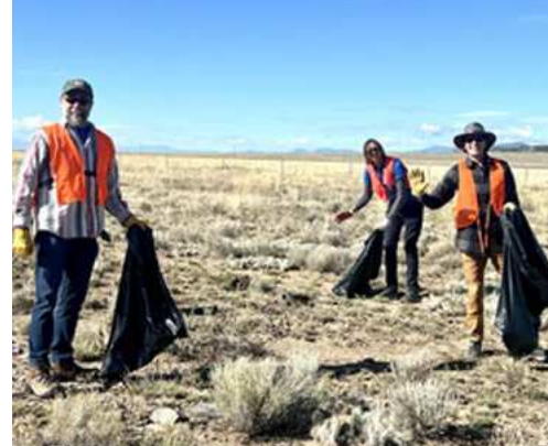
FRIENDLY FACES IN FRIENDLY PLACES!